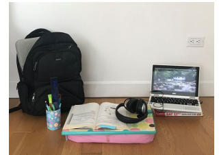
Pop Up Study Space