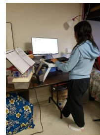
Standing Desk Study Space