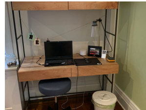
General Study Space

A learning space through which work is produced in an efficient manner.